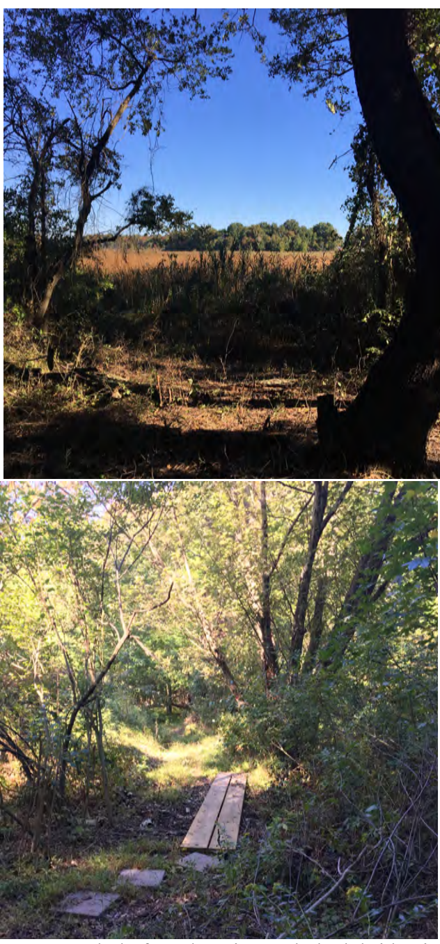
Proposed platform location and plank bridge in the forested area