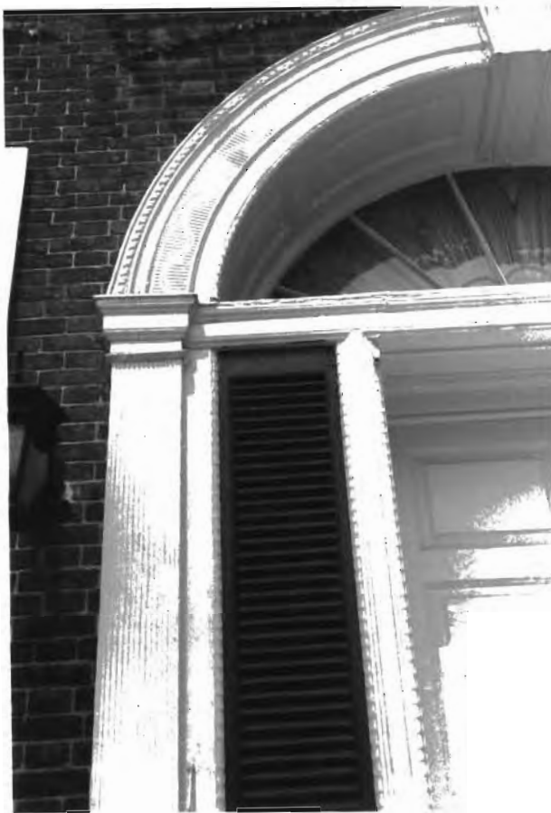
Illustration 6. Photograph of doorway detail, The George Read (II) House.

in letters written during the construction. The marble entrance steps, which blend well with the rest of the house, are a twentieth century addition.