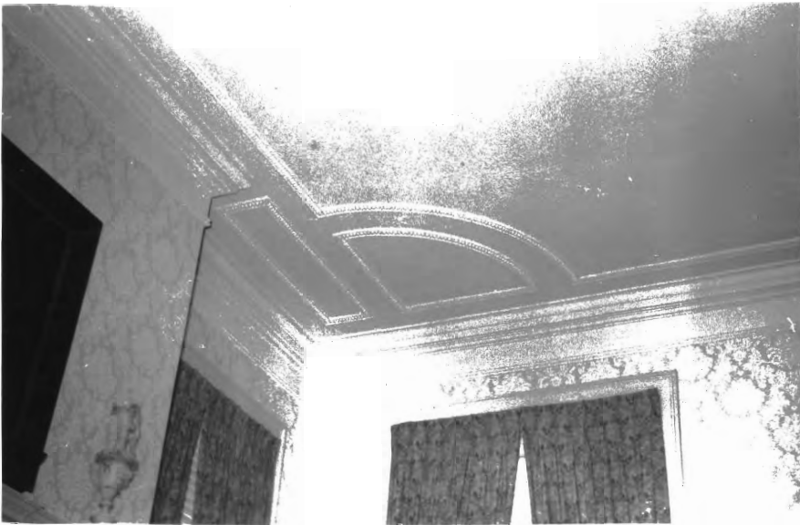
Illustration 11. Photograph of ceiling detail, first floor, back parlor, The George Read (II) House.