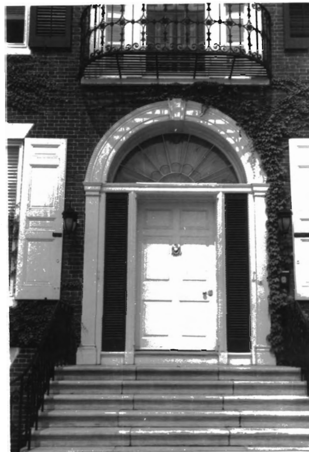
Illustration 5. Photograph of entrance, The George Read (II) House.