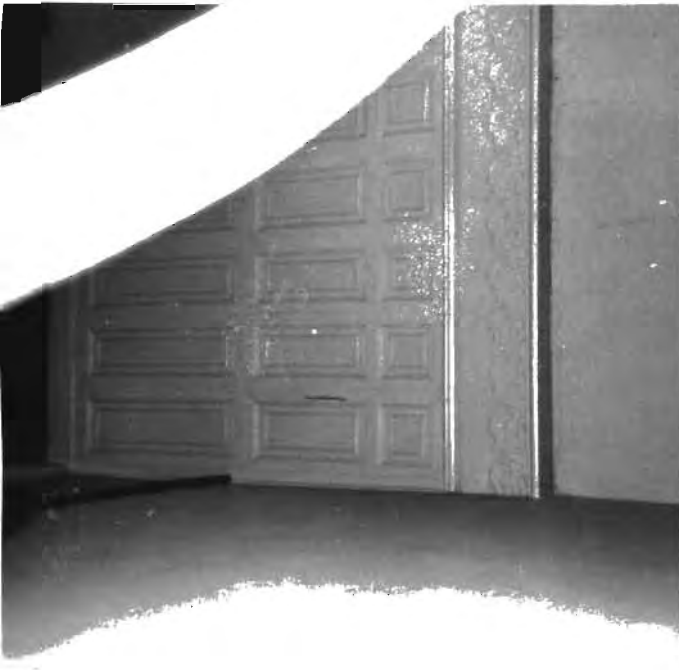
Illustration 15. Detail of paneling on stair landing between second and third floors, The George Read (II) House.