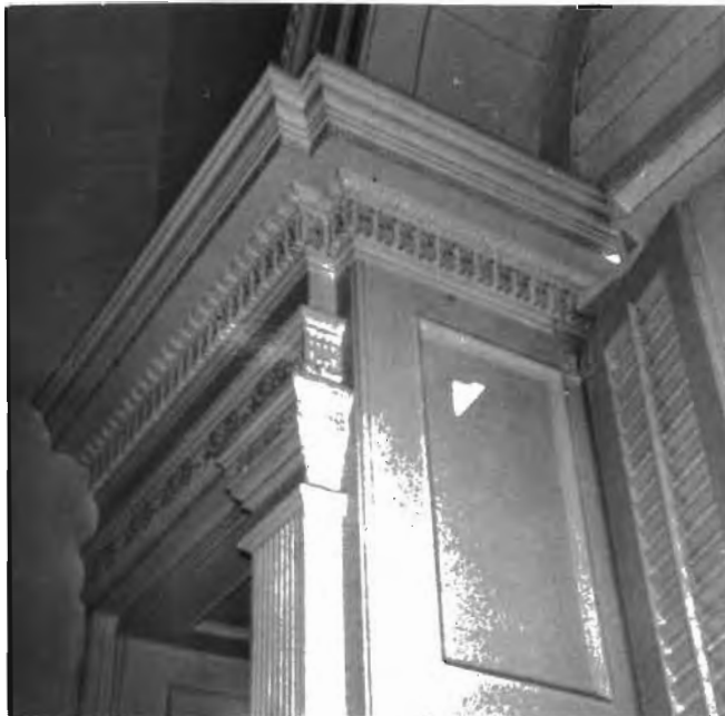
Illustration 13. Detail of Palladian window woodwork, Second floor Hallway, The George Read (II) House.

Relatively unusual features of the bedrooms are the large full length closets, built into the fireplace walls. These were apparently original. 4 Another