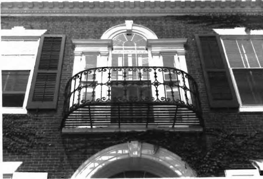
Illustration 7. Photograph of Palladian window and iron railing, second floor front, The George Read (II) House.

and office. (Illustration 8). The central area of the hall has a plasterwork ceiling, decorated with a central medallion surrounded by widely spaced five-pointed stars. A plain molding at the edge separates a simple border of rosettes from a trailing vine of leaves and berries. The plasterer filled empty spaces between the vine and the stars with sprays of leaves and acorns. (Illustration 9).