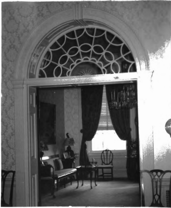
Illustration 10. Photograph of interior archway, first floor, The George Read (II) House.