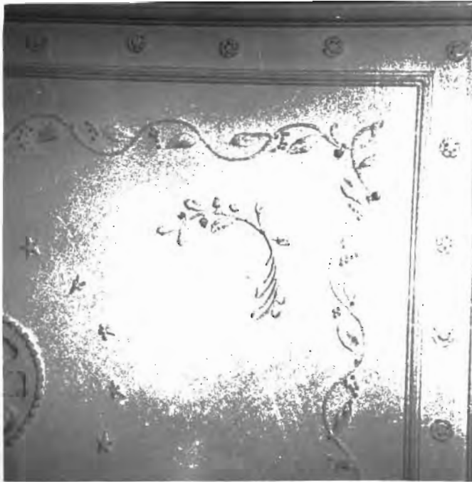
Illustration 9. Photograph of ceiling detail, first floor hallway, The George Read (II) House.