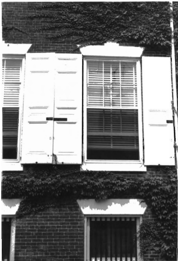
Illustration 4. Photograph of front window, The George Read (II) House.