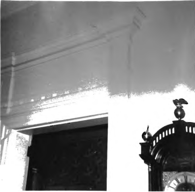
Illustration 14. Detail of doorway, second floor hallway, The George Read (II) House.