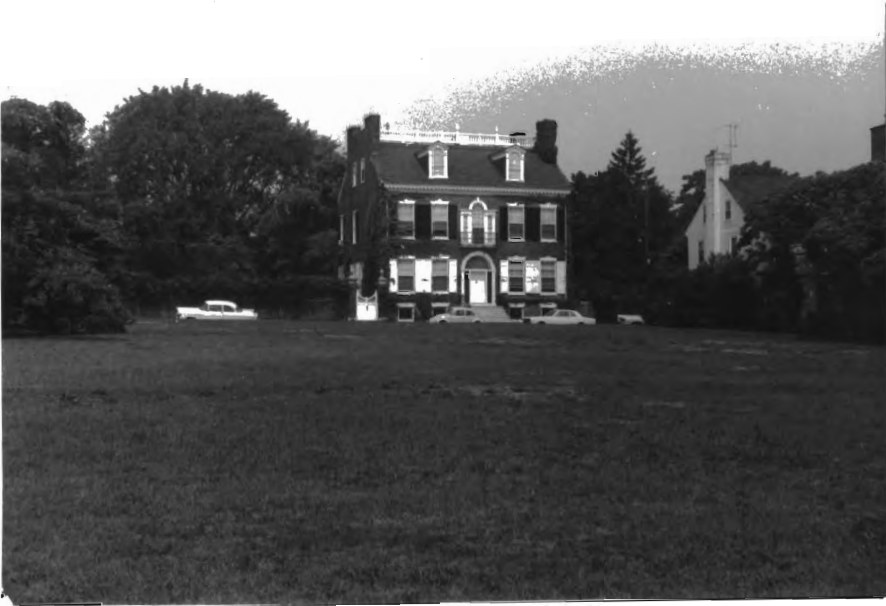
Illustration 2. Front view of The George Read (II) House, New Castle, Delaware.

In 1971 the George Read (II) house looks much as it did soon after its completion in the first years of the nineteenth century. (Illustration 2). In 1804, Benjamin Henry Latrobe depicted it in his survey of the town of New Castle. (Illustration 3). At that time it was set between two houses of a smaller scale and of an earlier date, one of which, a brick house with a pent eave, had been owned by George Read (I). Both