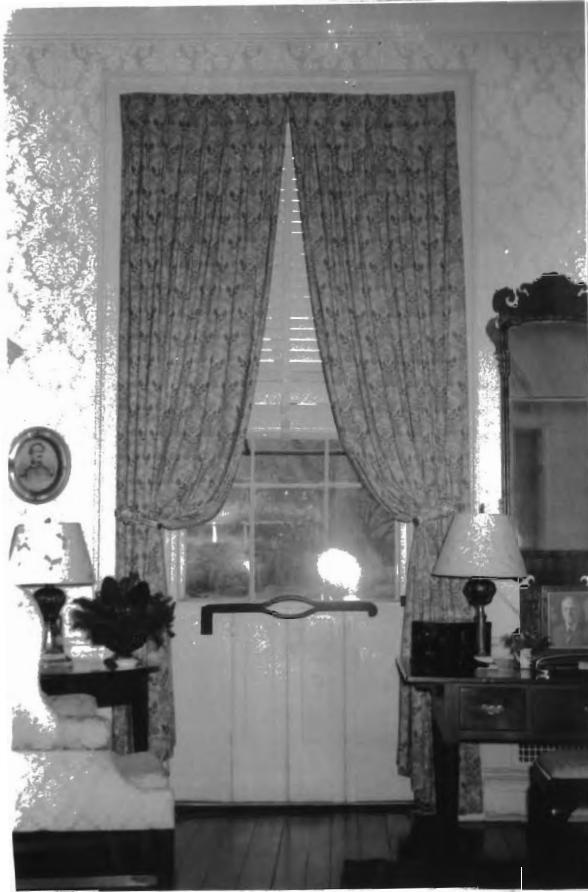
Illustration 12. Photograph of French window, first floor, back parlor, The George Read (II) House.

Palladian window lights not only the stairs, but the halls below and above.